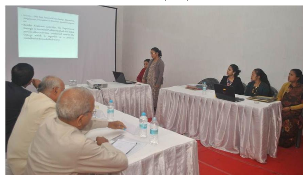
MEETING WITH THE DEPARTMENT OF EDUCATION