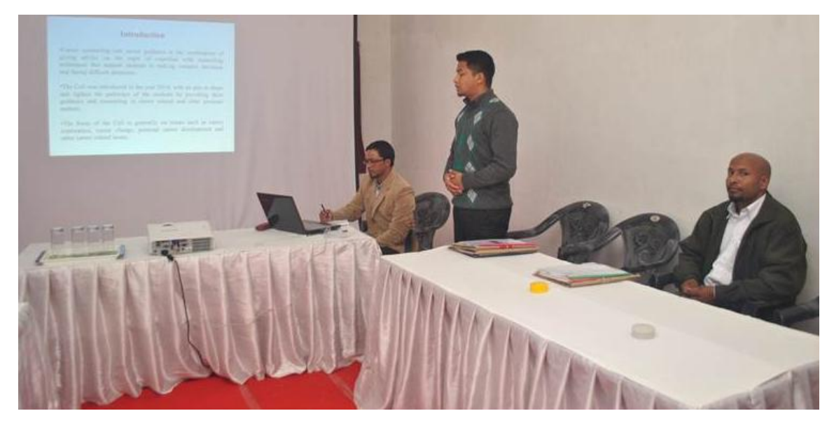
MEETING WITH THE CAREER GUIDANCE & COUNSELLING CELL