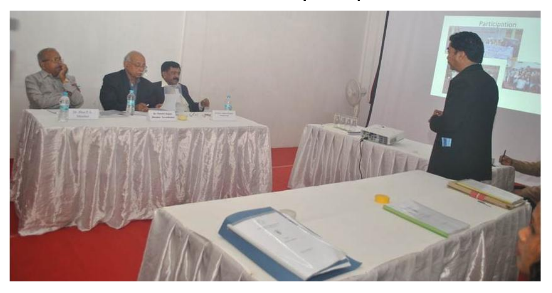
MEETING WITH THE EXTENSION COMMITTEE