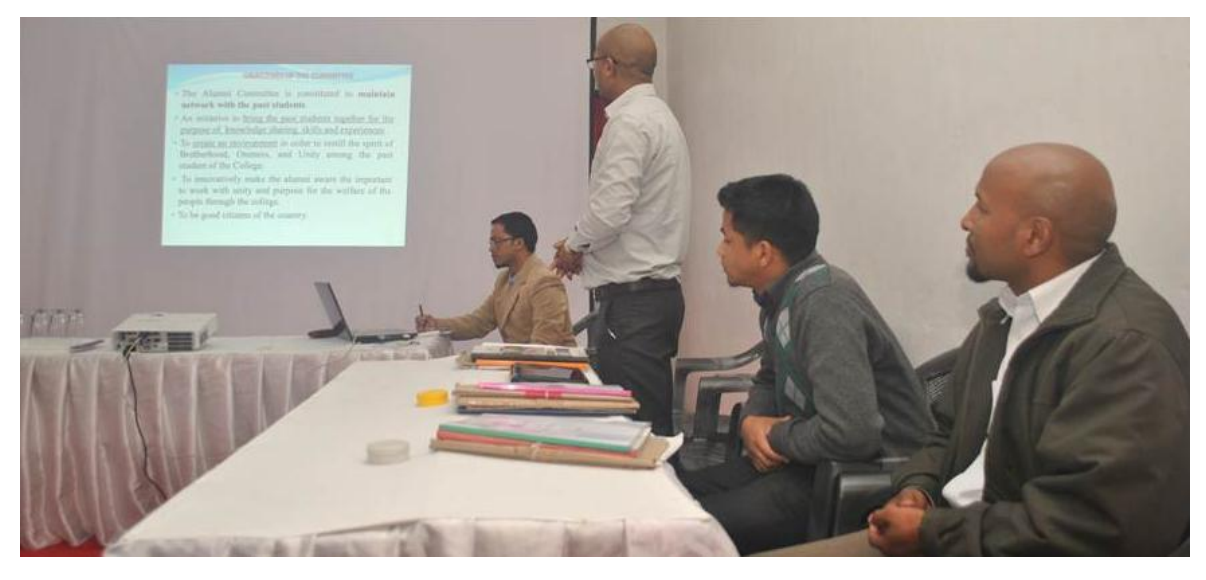
MEETING WITH THE ALUMNI COMMITTEE