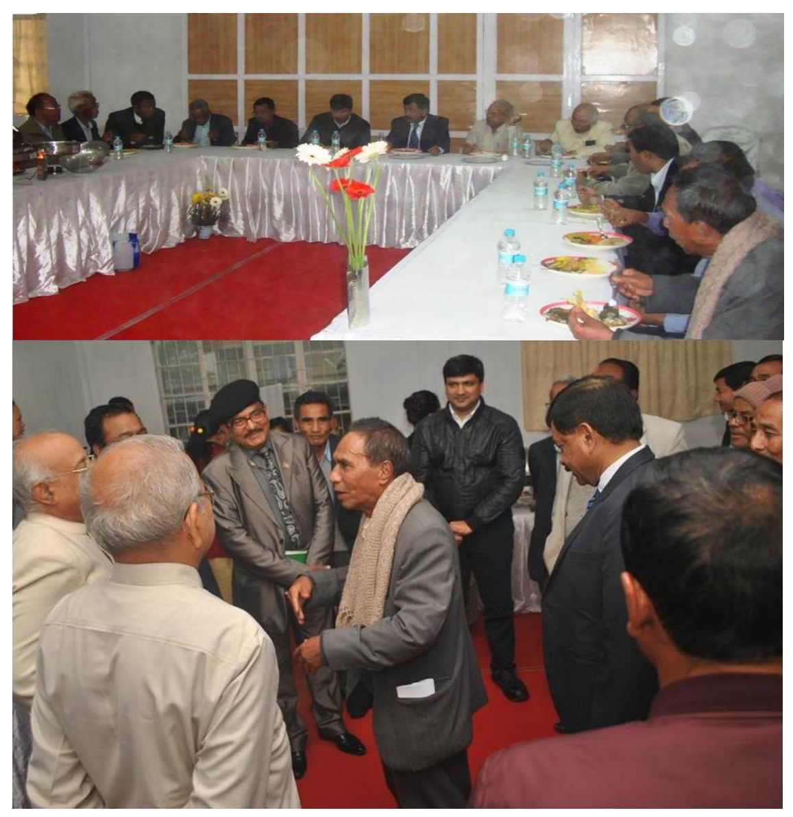
LUNCH ON MEETING