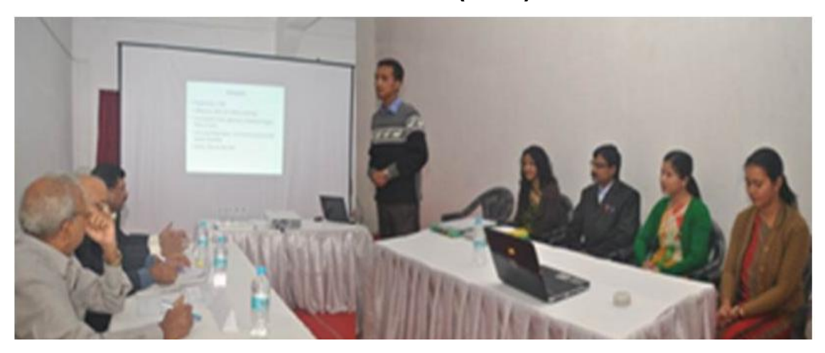
MEETING WITH THE DEPARTMENT OF ENGLISH