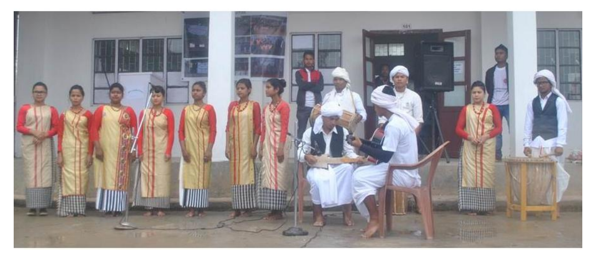
WELCOME SONG BY THE STUDENTS