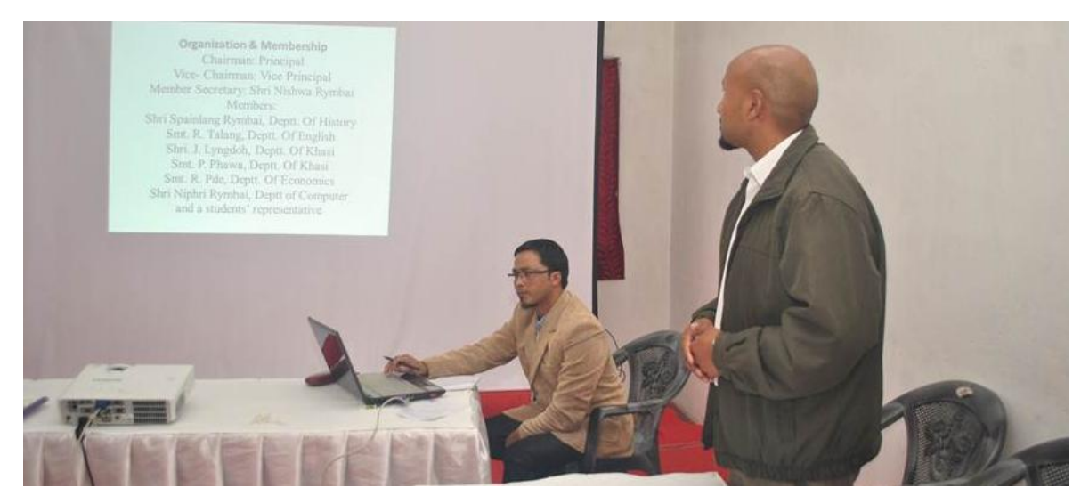
MEETING WITH THE GRIEVANCE REDRESSAL CELL (GRC)