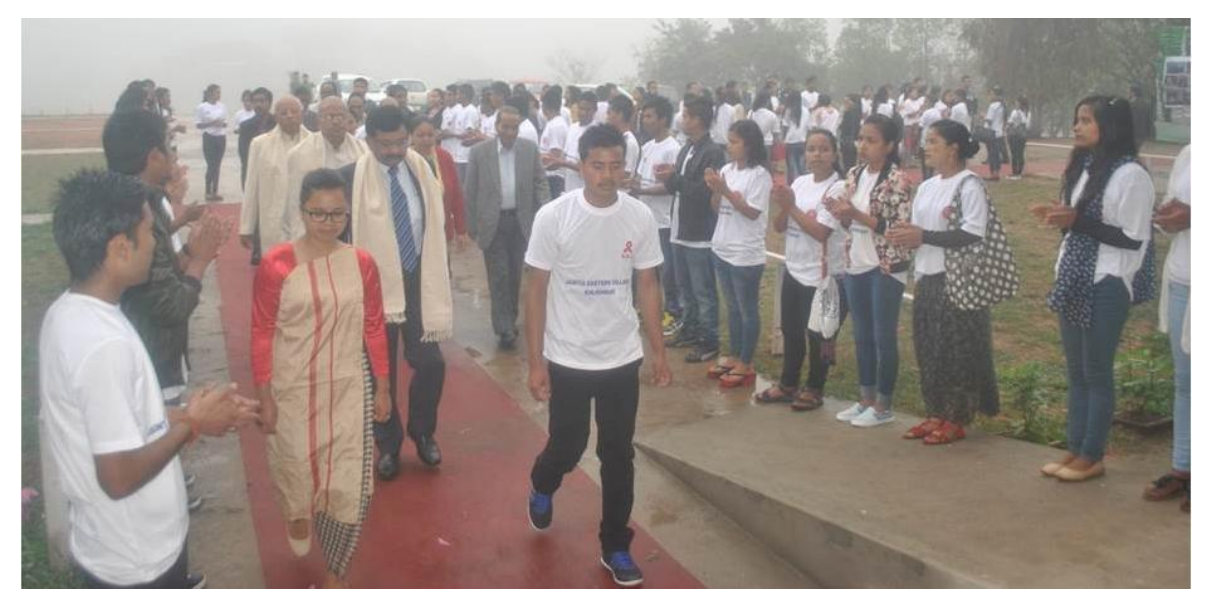
NSS AND RRC VOLUNTEERS ESCORTING NAAC POEER TEAM MEMBERS TO PRINCIPAL CHAMBER