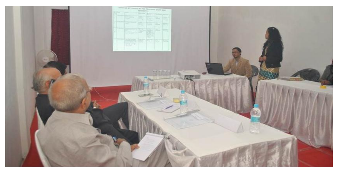
MEETING WITH THE SEMINAR COMMITTEE