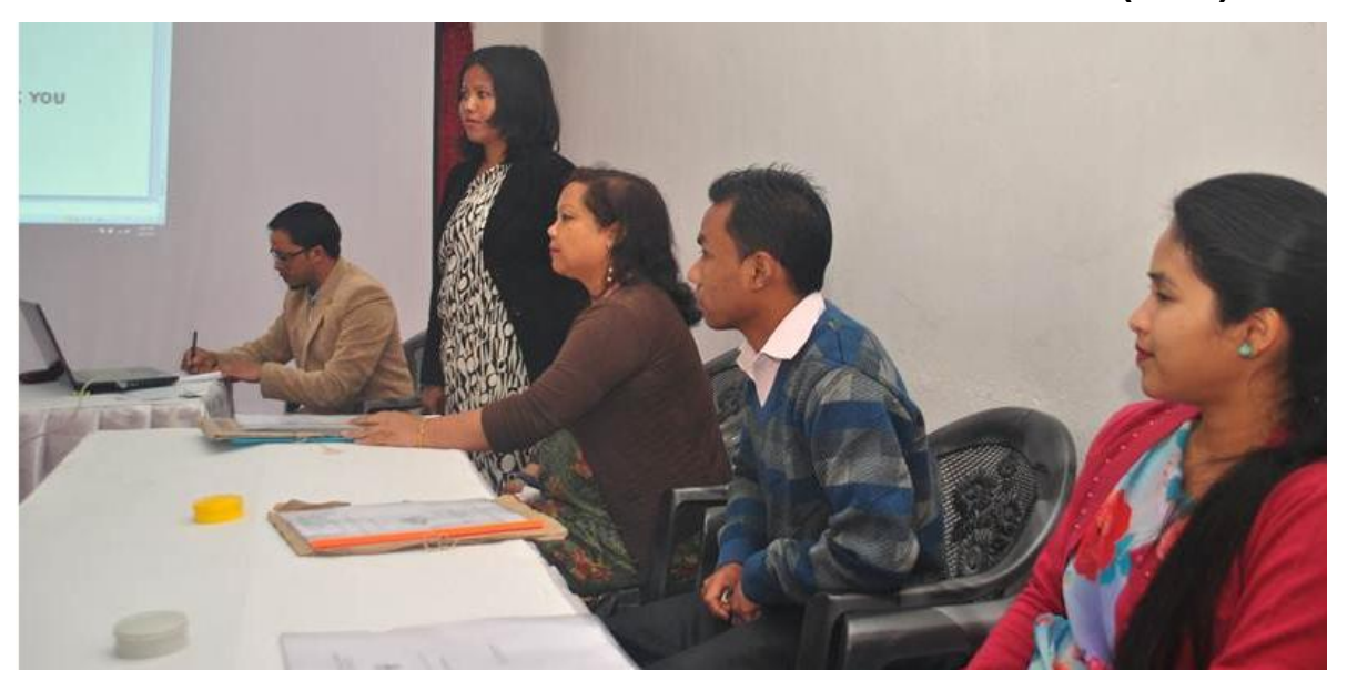
MEETING WITH THE PARENTS TEACHER COMMITTEE