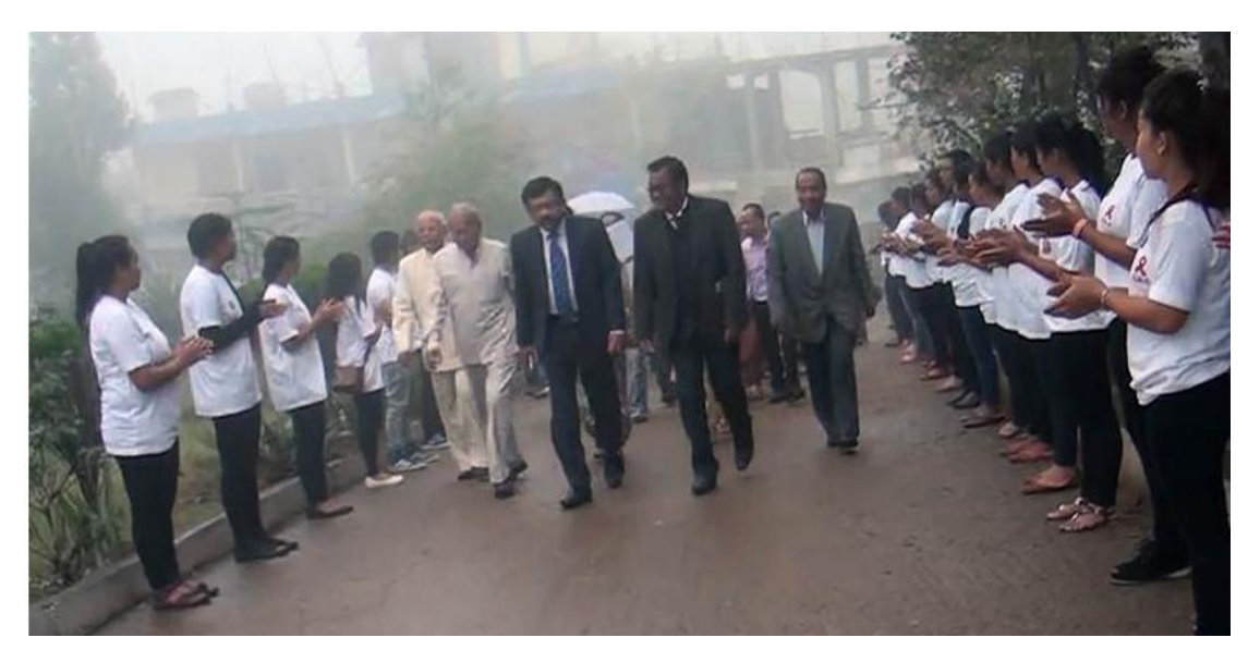
STUDENTS WELCOMING THE NAAC PEER TEAM VISIT