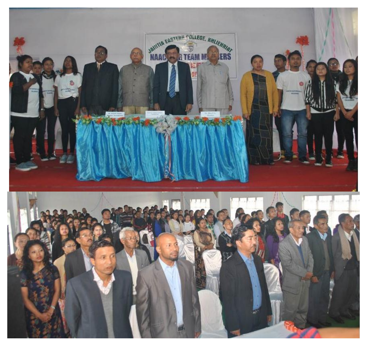
SINGING OF NATIONAL ANTHEM