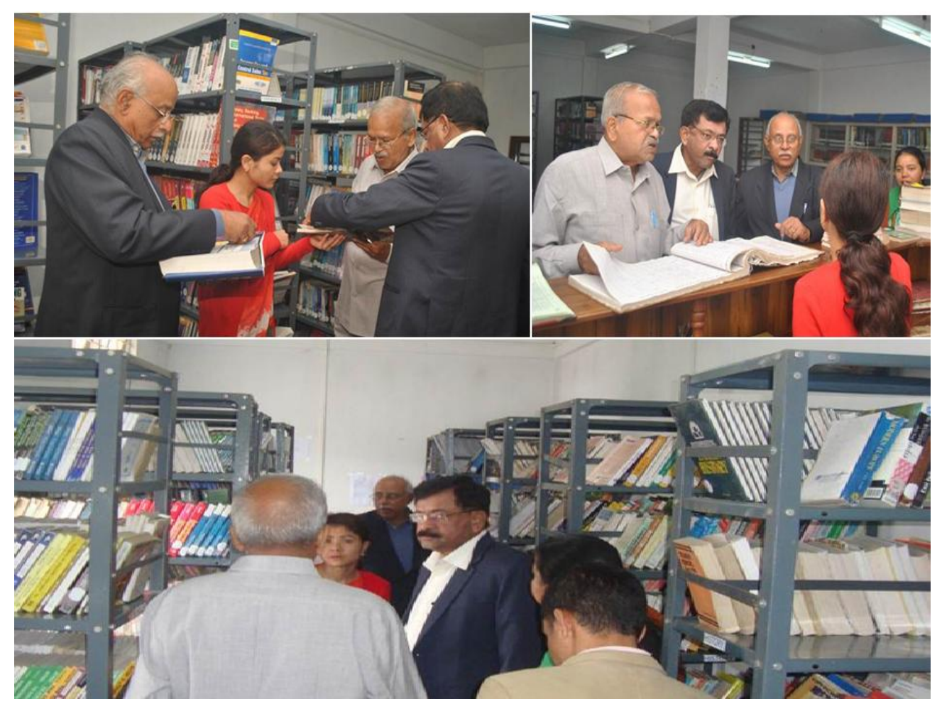
VISIT OF LIBRARY AND INTERACTION WITH THE LIBRARIAN