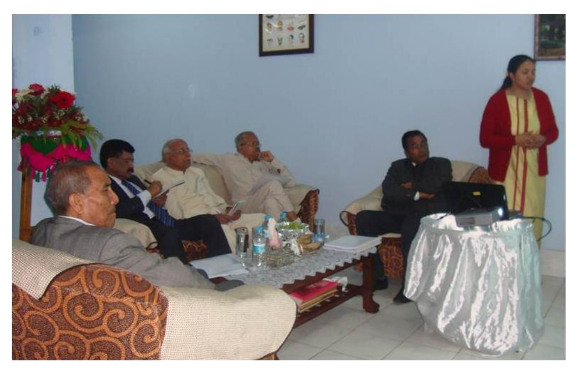
MEETING WITH COORDINATOR IQAC