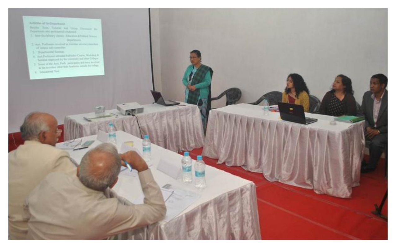
MEETING WITH THE DEPARTMENT OF HISTORY