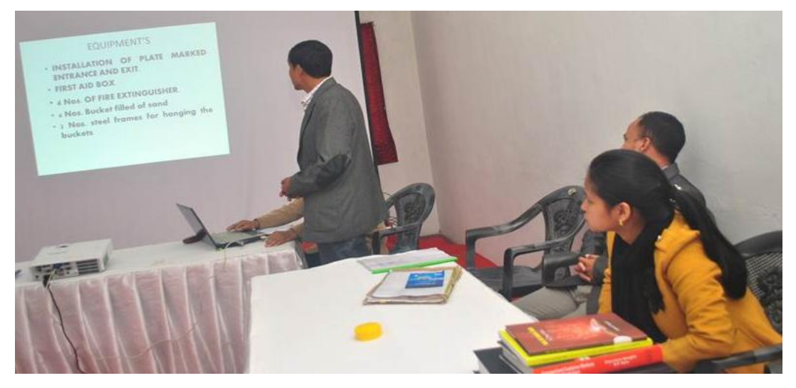
MEETING WITH THE DISASTER MANAGEMENT CELL