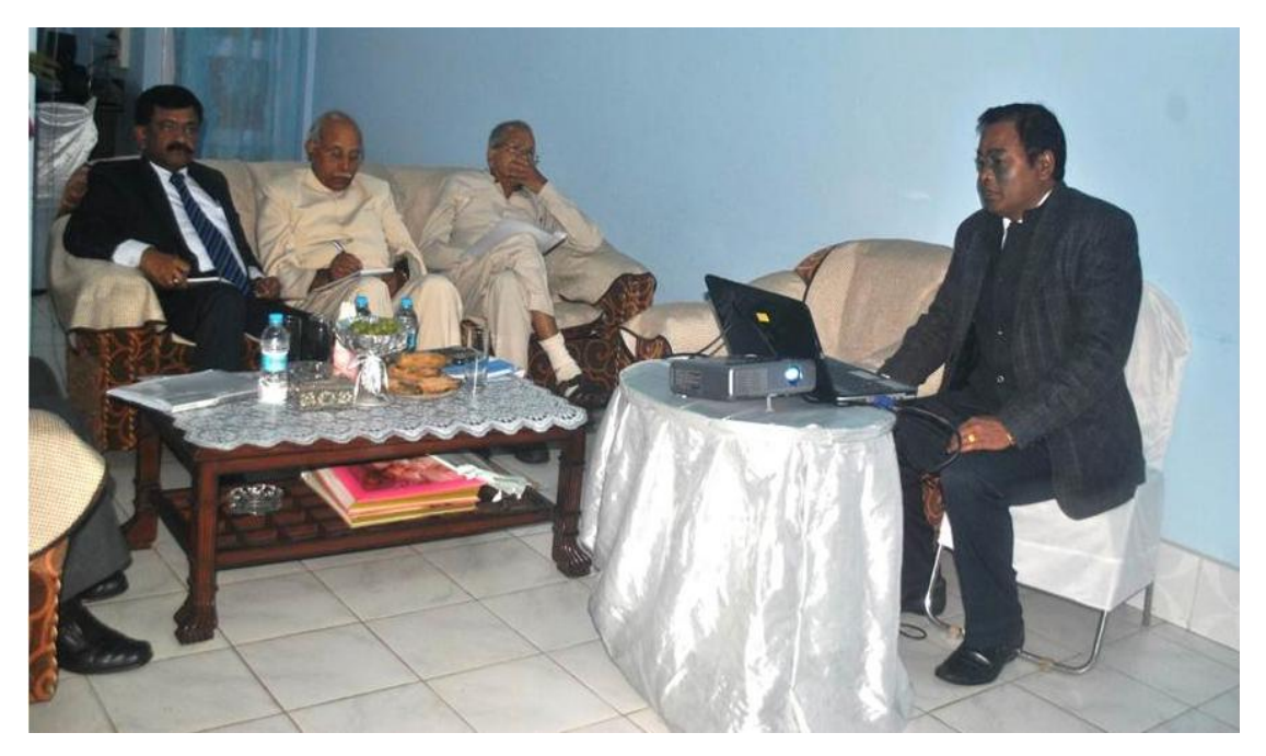
MEETING WITH PRINCIPAL