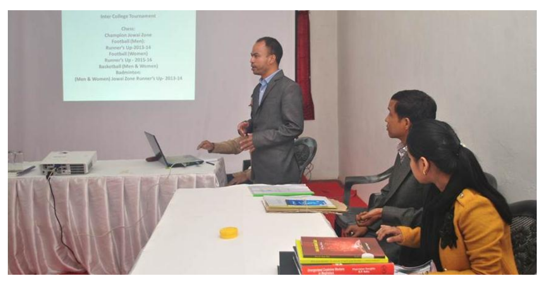
MEETING WITH THE GAMES & SPORTS COMMITTEE