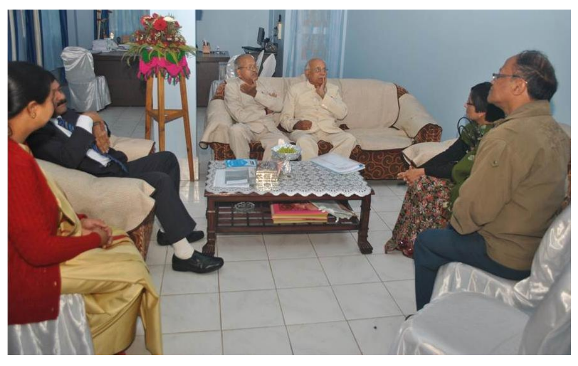
INTERACTION WITH NEHU & DHTE OFFICIALS