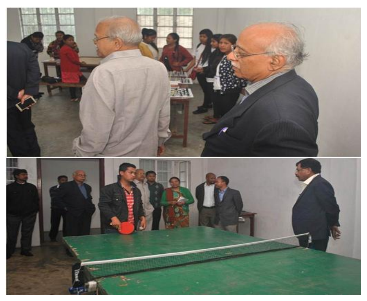
VISIT OF STUDENTS COMMON ROOMS (Boys & GIRLS)