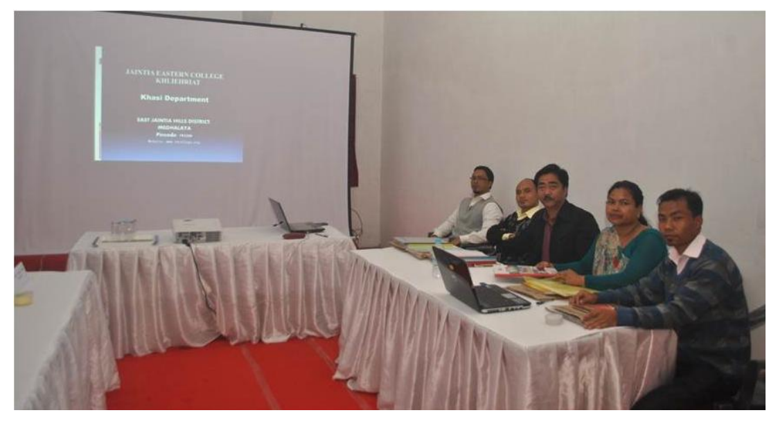
MEETING WITH THE DEPARTMENT OF KHASI